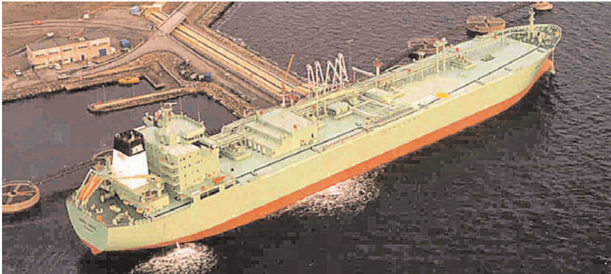
Fully refrigerated LPG carrier.

inerting and for the dehydration of the cargo system as well as the interbarrier spaces during voyage. For these condensation occurs on cold surfaces with unwanted build-ups of ice. Deck tanks are normally provided for changeover of cargoes.