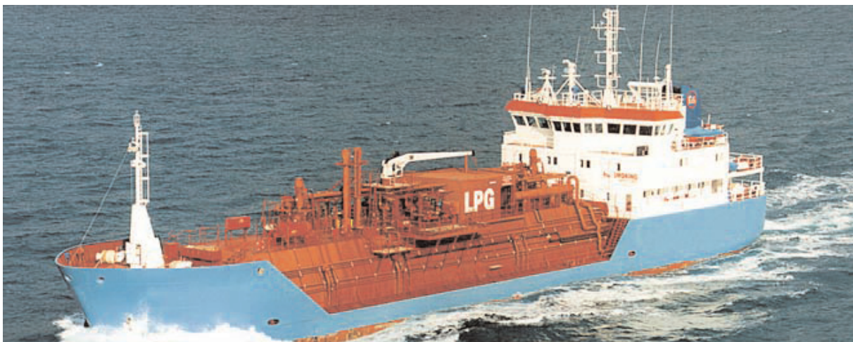
Semi-pressurised LPG carrier.

The ships range in size from about 2,000 m 3 to 15,000 m 3 although several larger ships now trade in ethylene. Ship design usually includes independent cargo tanks (Type-C), and these may be cylindrical or bi-lobe in shape constructed from stainless steel. An inert gas generator is provided to produce dry inert gas or dry air. The generator is used for