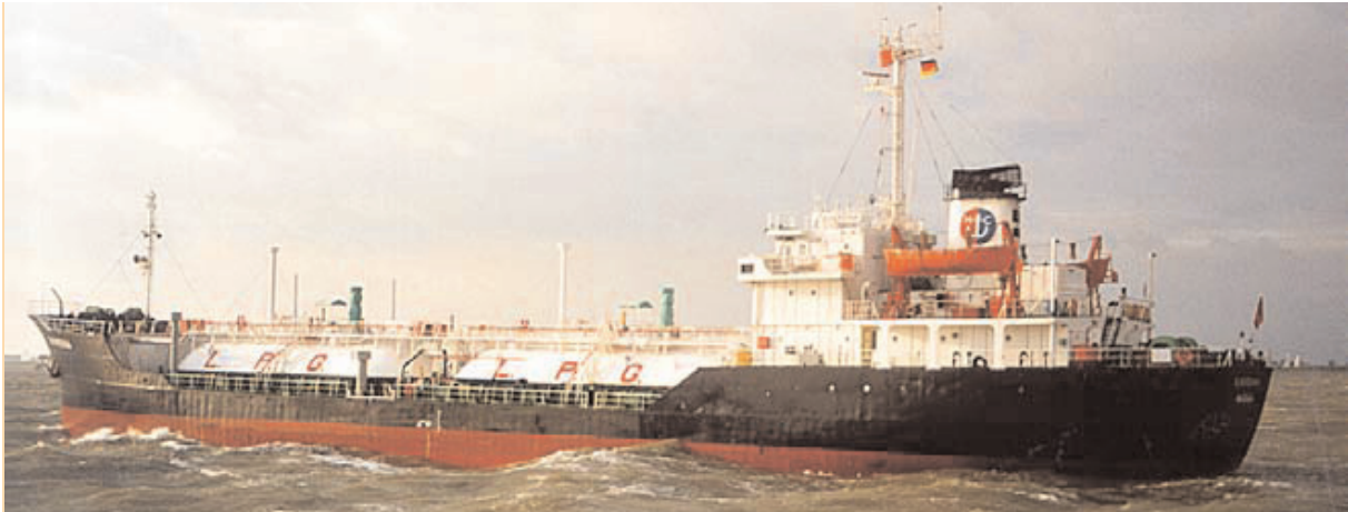
Pressurised LPG carrier with cylindrical tanks.

ballast tanks are prime candidates. These ships are the most numerous class, comprising approximately 40% of the fleet. They are nevertheless relatively simple in design yet strong of construction. Cargo operations that accompany such ships include cargo transfer by flexible hose and in certain areas, such as China, ship-to-ship transfer operations from larger refrigerated ships operating internationally are commonplace.